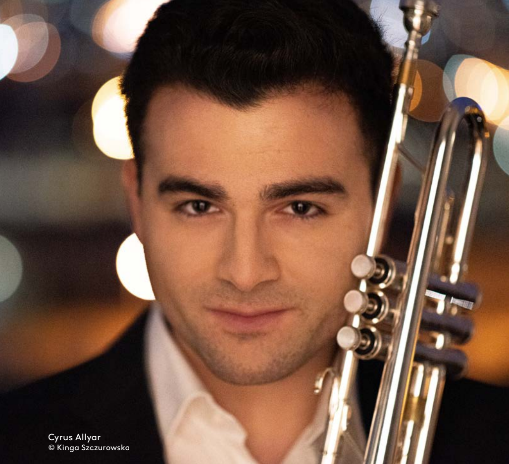
Cyrus Allyar